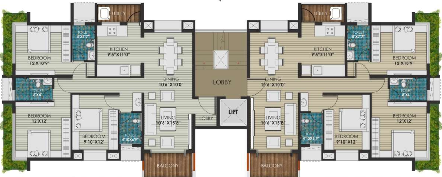
TYPICAL FLOOR PLAN (1st to 7th Floor)

FLAT NO. 101, 201, 301, 401, 501, 601, 701