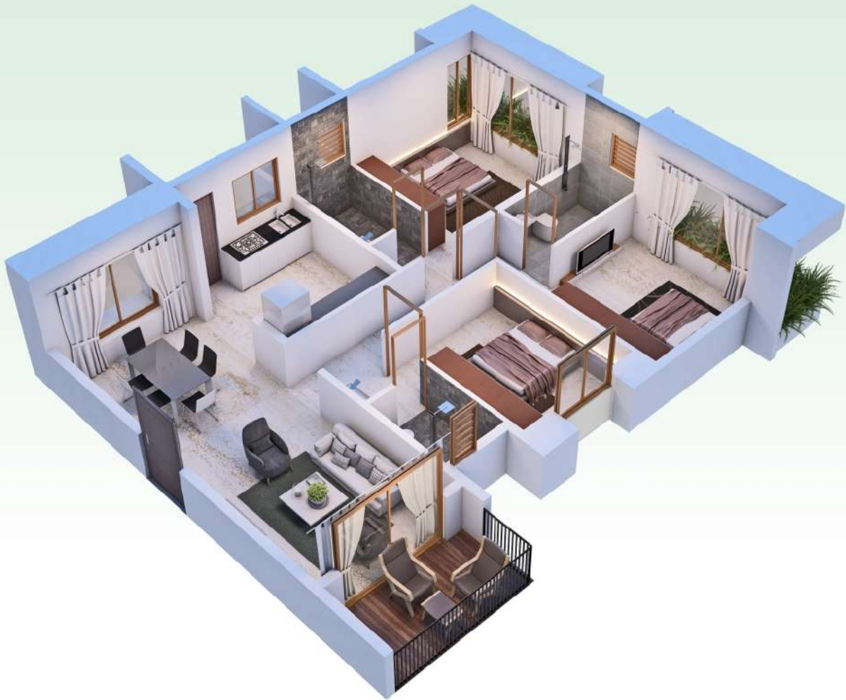
3D CUT VIEW