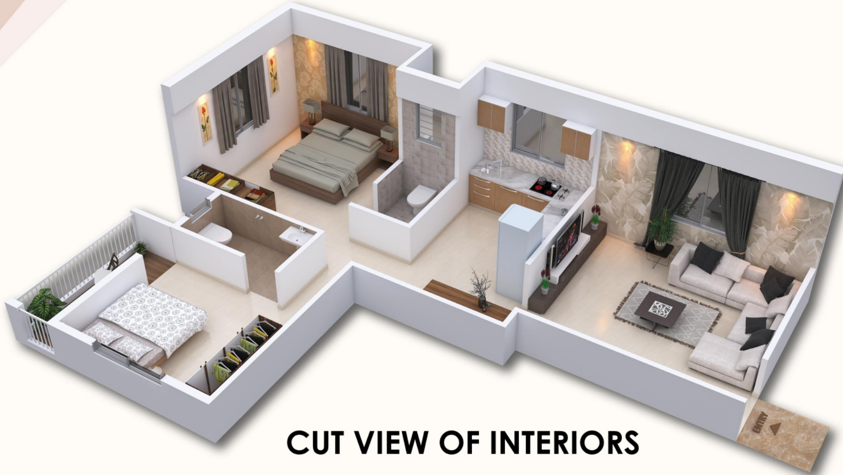
CUT VIEW OF INTERIORS